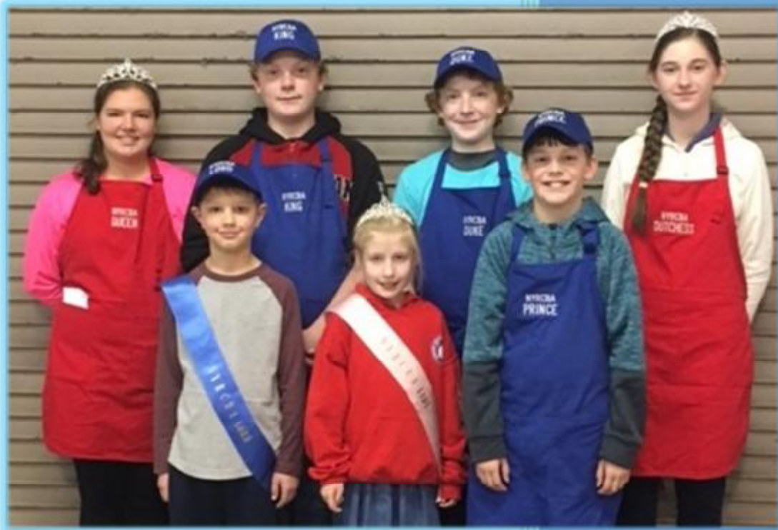
2017 Royalty Court

New York State Grand Finals and Convention September 29 & 30, 2018